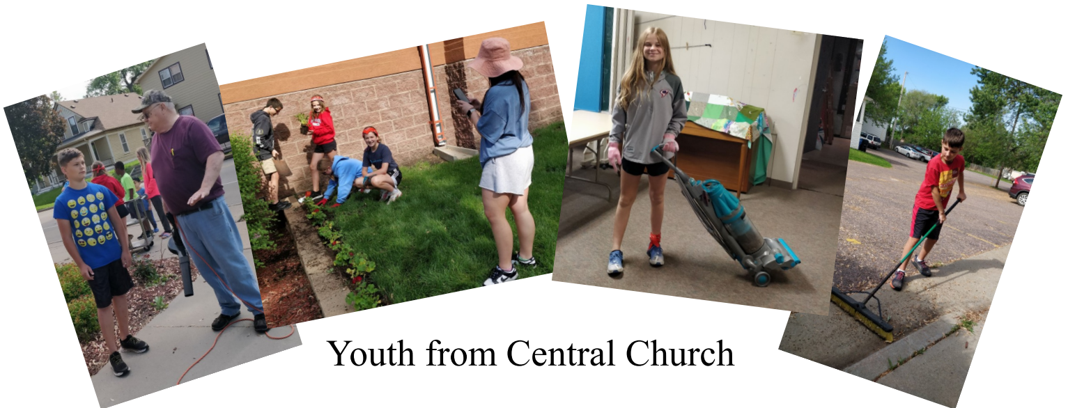
Youth from Central Church