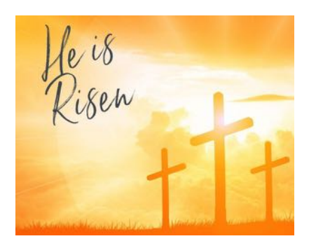
What's INSIDE this issue . . .